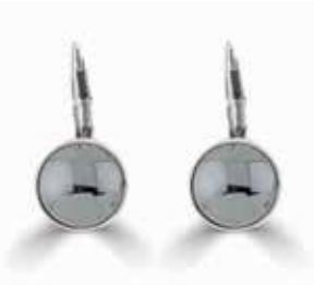
Contraire Hematite Drop Earrings E4203 Burnished silver hematite drop earrings