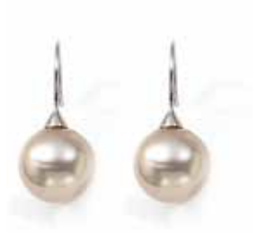
Kali Pearl Drop Earrings E4240 Champagne South Sea pearl drop earrings

Burnished silver open link pendant with champagne South Sea pearl