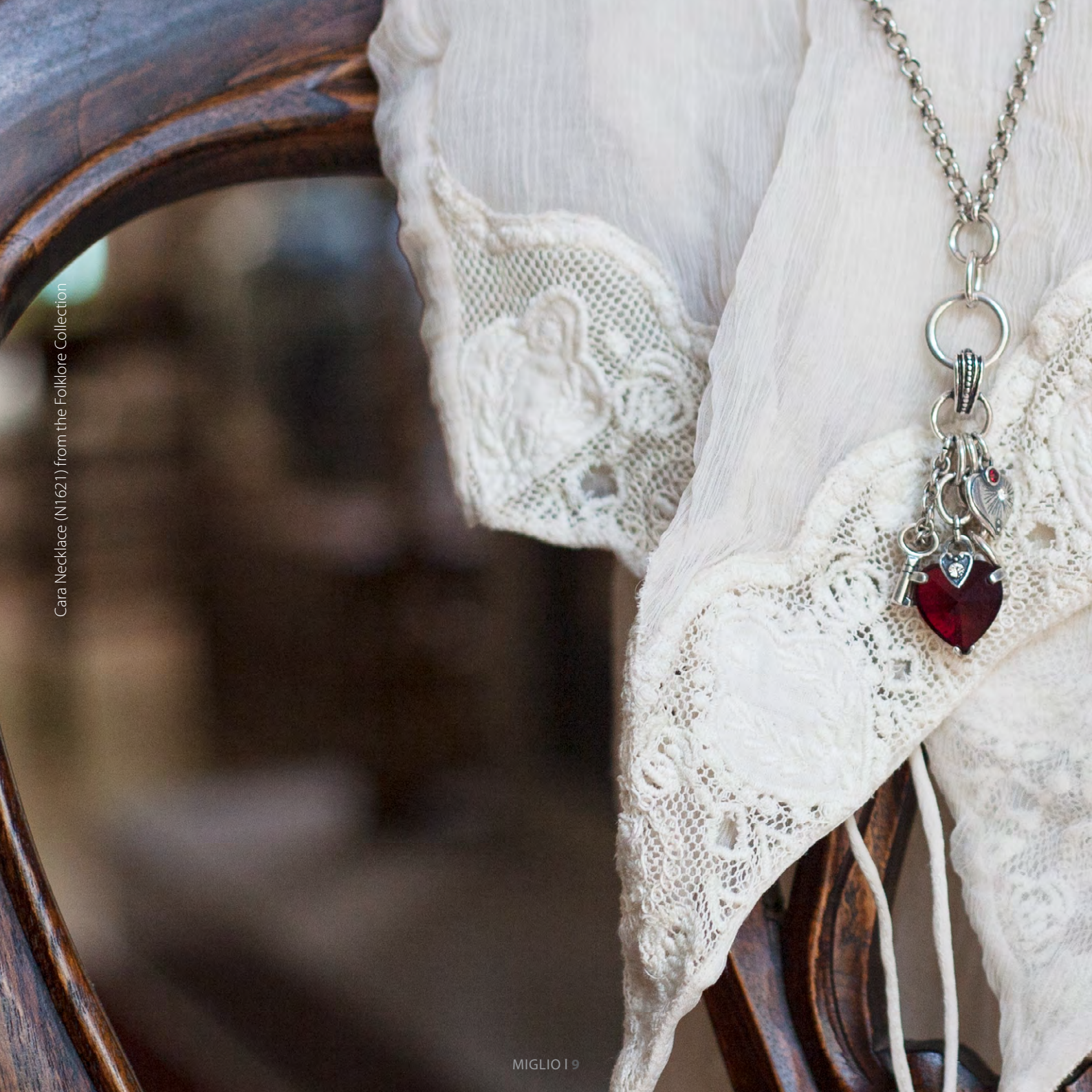
Cara Necklace (N°1621) from the Folklore Collection